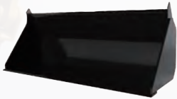
Light Material Bucket