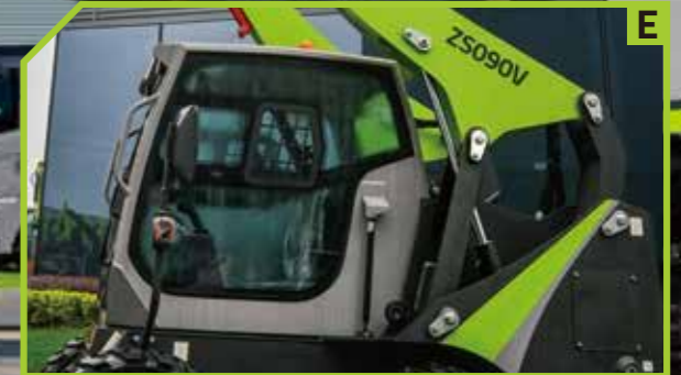
Hydraulic lines are located inside the lifting arm for perfect protection of the hydraulic lines