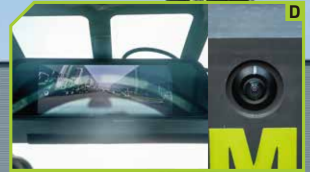
Optional reversing camera Its large display at the front of the cab and the high-definition camera at the rear ensure a complete view of the machine's rear door