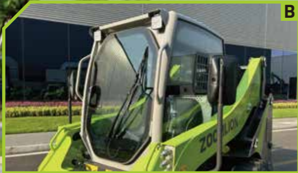
FOPS/ROPS cab A cab certified for FOPS/ROPS provides protection in the event of unforeseen rollovers and falling objects