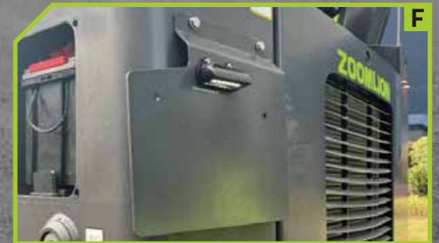
Optional license plate holder and license plate lamp at the rear end They make it easy to identify your vehicle