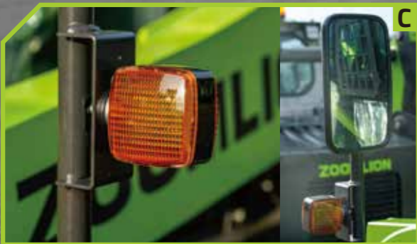
Optional turn signals and exterior rearview mirrors They do not move with the lifting arm, making it easy to observe the situation at the back of the body at any time and keeping you safe