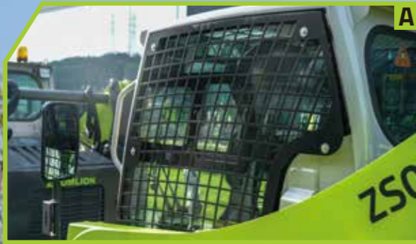
Optional cab side guard The side guard protects your lateral safety