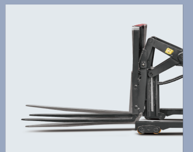
The forks' tilting function is easy for loading and unloading pallets.