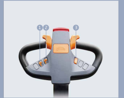
FREI Multi-Function Tiller 1: Forks move forward / backward 2: Lifting / lowering of forks 3: Forward / backwards tilting of forks