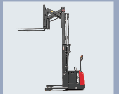
Travel speed is reduced automatically when the forks are lifted past a specified height.