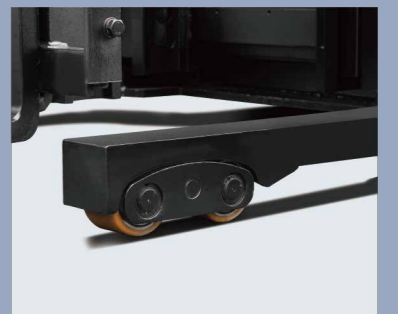
The structure of the rotary load wheel offers better rolling ability and stability.