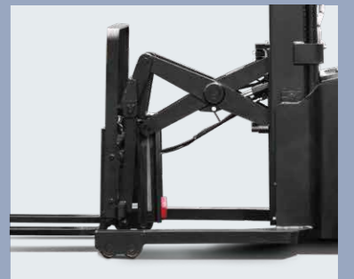
Forks move forward by the scissor structure