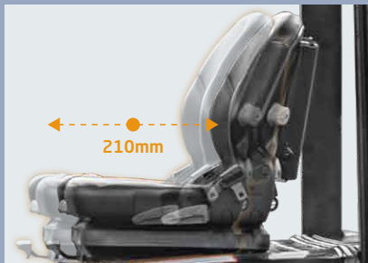
The seat can be adjusted back and forth by 210mm. The operator can choose the best driving position