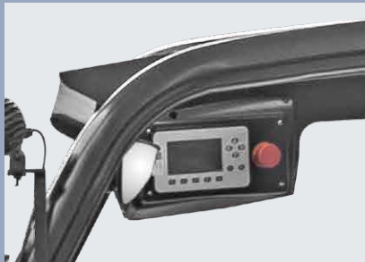
The dashboard in the driver's cab is placed overhead and can be seen when the driver lift her/his head, and the function buttons can be pressed easily