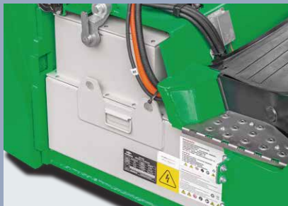
The packs can be easily removed by a manual or electric cart, and can be repaired and maintained conveniently