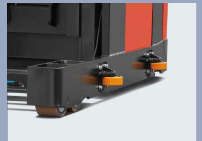
Rail guidance rollers (Opt.) can be fitted to the truck for VNA working