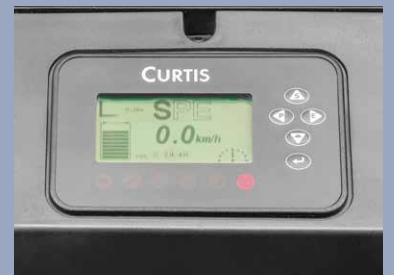
Standard LCD display informs the driver about all necessary informations