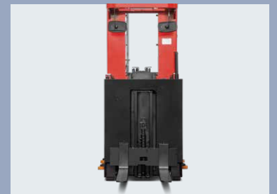
Supplementary lift on operator platform. Pallet can be raised to most convenient working level for picking