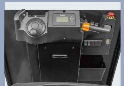
Control and display panel integrated are perfectly in the drivers field of view