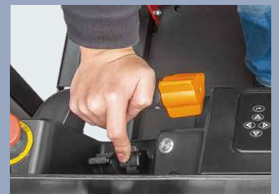
Simultaneous driving/lifting/lowering, simple and ergonomic controls allow precise operation reducing driver fatigue and increasing throughput